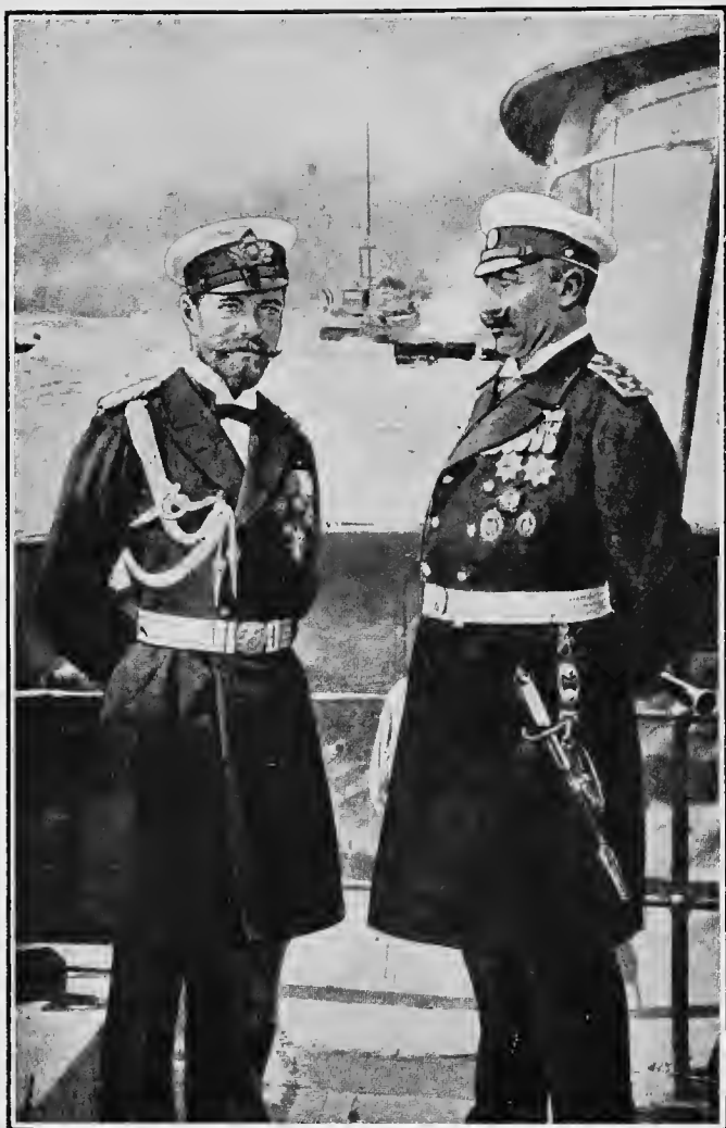
THE KAISER AND THE CZAR ABOARD THE "HOHENZOLLERN."